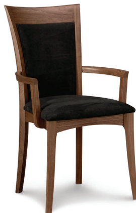
Morgan Armchair 8-MOR-32-04