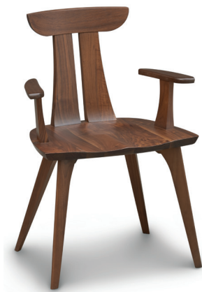
Estelle Arm Chair 8-EST-52-04