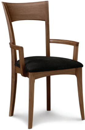
Ingrid Armchair - Upholstered Seat 8-ING-22-04