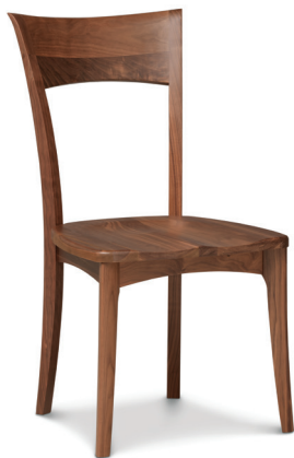
Ingrid Sidechair - Wood Seat 8-ING-21-04