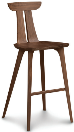
Estelle Bar Stool - seat height 30" 8-EST-65-04