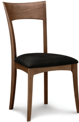
Ingrid Sidechair - Upholstered Seat 8-ING-20-04