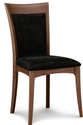
Morgan Sidechair 8-MOR-30-04