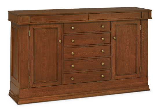
Buffet - Based on the actual measurements of the built-in buffet in the Dana-Thomas House, this stand-alone adaptation offers generous storage space.

Finishes: Parkton Oak (17), Madison Oak (27), Parkton Cherry (13) or Natural Cherry (03) Upholstery options: Copeland fabric/leather selection or Customer's own material (COM)