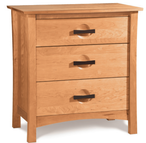
3 Drawer 2-BER-30-XX