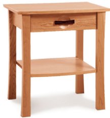
1 Drawer Nightstand 2-BER-11-XX