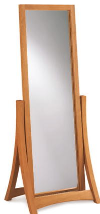
Floor Mirror 5-BER-30-XX