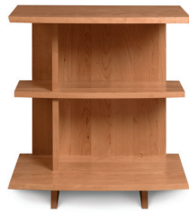
Nightstand - left 2-BER-01-XX