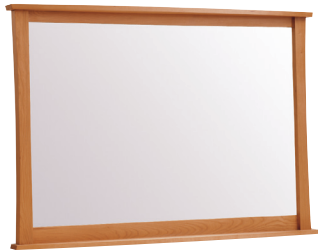
Wall Mirror 5-BER-21-XX