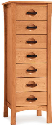
7 Drawer 2-BER-70-XX