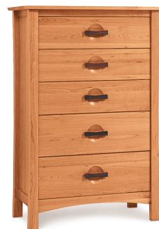
5 Drawer 2-BER-50-XX