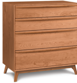
4 Drawer 2-CAL-40-XX