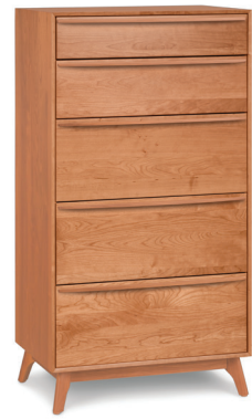
5 Drawer 2-CAL-50-XX