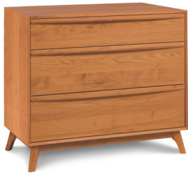
3 Drawer 2-CAL-30-XX