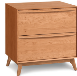
2 Drawer Nightstand 2-CAL-22-XX