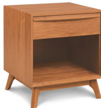
1 Drawer Nightstand 2-CAL-10-XX