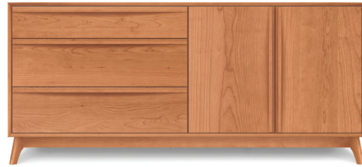
3 Drawers on Left, 2 Doors on Right Dresser 2-CAL-52-XX 66 1/8"w x 18"l x 29 7/8"h