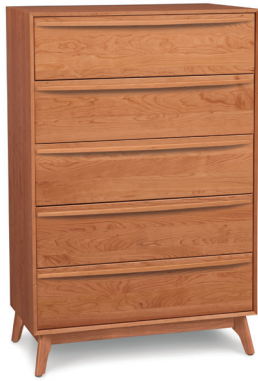
5 Drawer Wide 2-CAL-55-XX