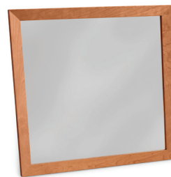
Wall Mirror 5-CAL-20-XX