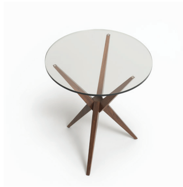
Converge Round End Table 5-CVG-24-00-04