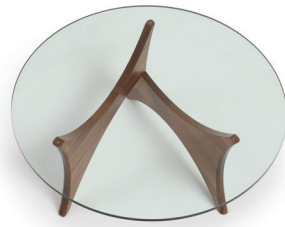
Pivot Round Coffee Table