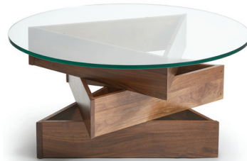
Twist Round Coffee Table