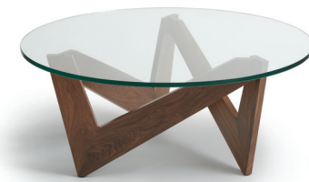
Check Round Coffee Table 5-CHK-42-00-04 42"w x 42"l x 16 3/4"h