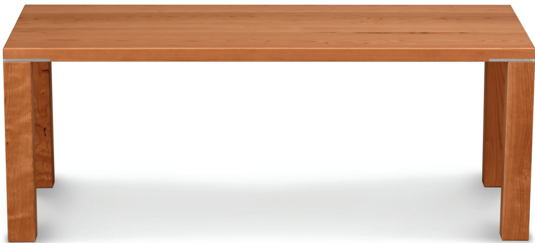
Coffee Table in Natural Cherry 24" w x 48" l x 18" h