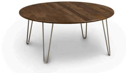
Essentials Round Coffee Table 8-ESS-48-24-16-XX metal legs 8-ESW-42-00-18-XX wood legs