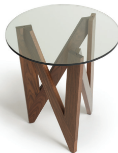
Check Round End Table