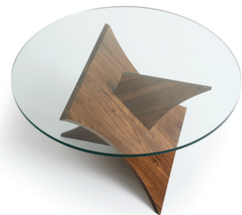
Planes Round Coffee Table 5-PLN-42-00-04 42"w x 42"l x 18"h