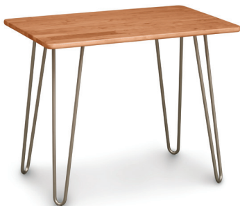
Essentials Rectangle End Table 8-ESS-30-20-24-XX metal legs 8-ESW-30-20-24-XX wood legs