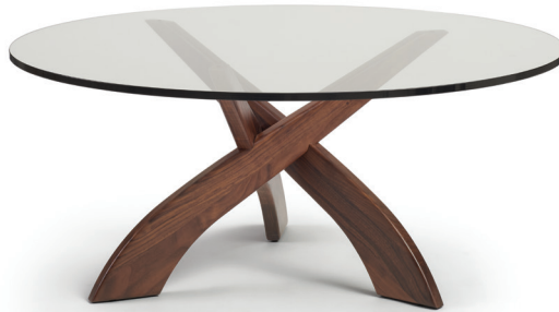
Entwine Round Coffee Table 5-ENT-42-00-04 42"w x 42"l x 18"h