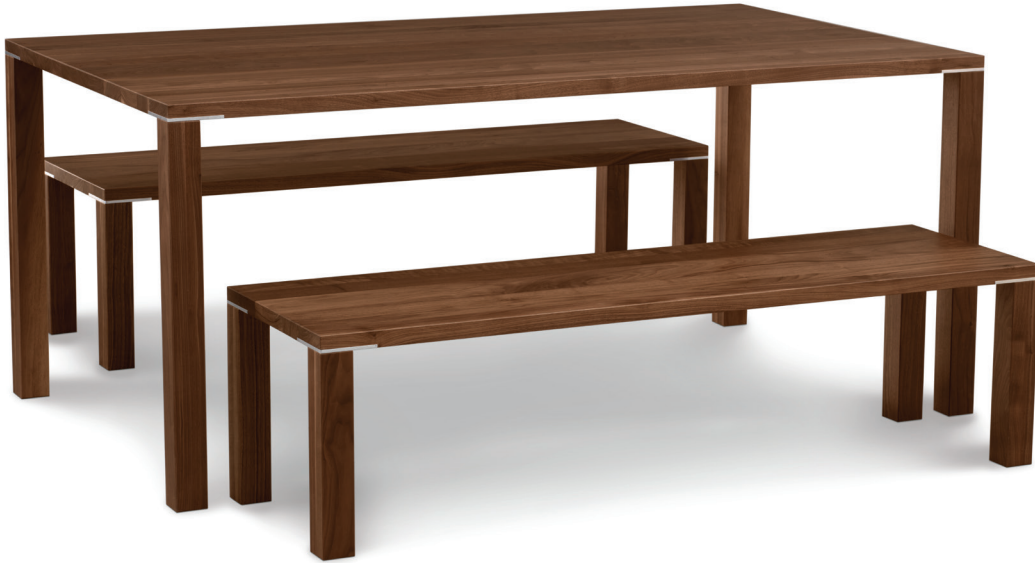
Dining Table in Natural Walnut 40"w x 70"l x 30"h