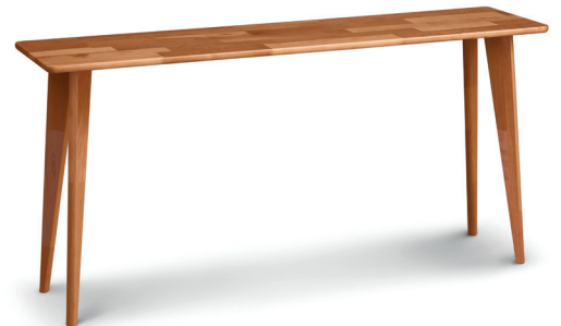
Essentials Sofa Table 8-ESS-60-15-29-XX metal legs 8-ESW-60-15-29-XX wood legs