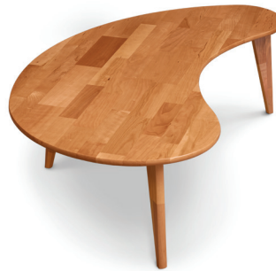
Essentials Kidney Shaped Coffee Table 8-ESS-54-10-16-XX metal legs 8-ESW-54-10-16-XX wood legs