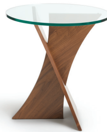
Planes Round End Table 5-PLN-24-00-04