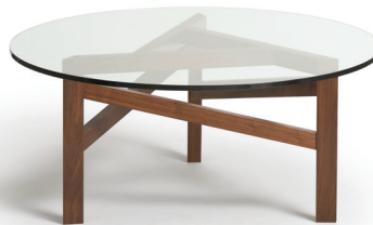
Glide Planes Round Coffee Table 5-GLP-42-00-04 42"w x 42"l x 16 3/4"h