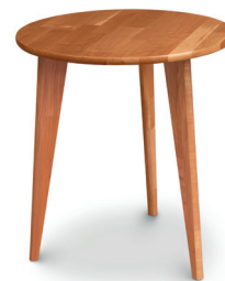
Essentials Round End Table 8-ESS-24-00-24-XX metal legs 8-ESW-24-00-24-XX wood legs

In stock and available to ship within one week