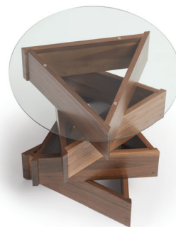
Twist Round End Table 5-TWT-24-00-04