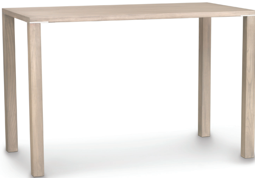
Counter Height Table in Soaped Ash 30"w x 55"l x 36"h