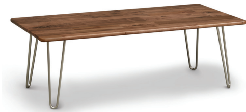
Essentials Rectangle Coffee Table 8-ESS-48-24-16-XX metal legs 8-ESW-48-24-16-XX wood legs

The Essentials Tables are crafted in solid American black walnut or natural cherry hardwood. The tables in walnut are finished with low sheen (10 sheen) top coat. The finish is GREENGUARD Certified for low chemical emissions.