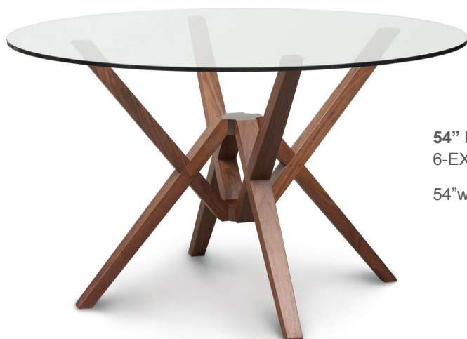
54" Round Glass Top Table 6-EXE-35-04 54"w x 54"l x 30"h