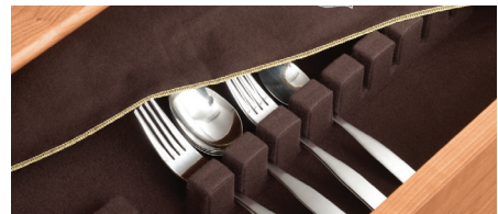
The silverware drawer is fitted with an anti-tarnish insert.