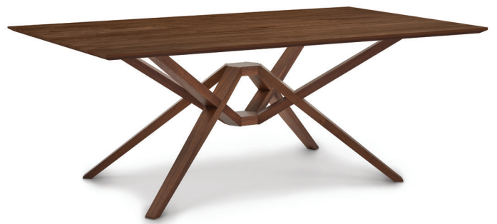
48" x 84" Table 6-EXE-13-04