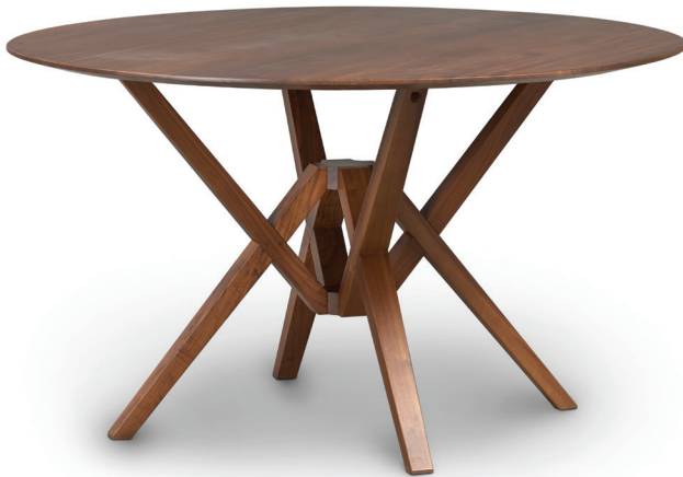
54" Round Table 6-EXR-54-04