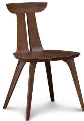
Estelle Side Chair 8-EST-50-04