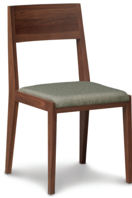
Kyoto Sidechair 8-KYO-40-04