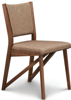
Exeter Chair 8-ESE-50-XX

Upholstered items are available in a range of microsuede, fabric, Ultrasuede®, Ultraleather®, Sunbrella® or leather colors as well as COM (customer's own material). Please refer to the upholstery page of this catalog.