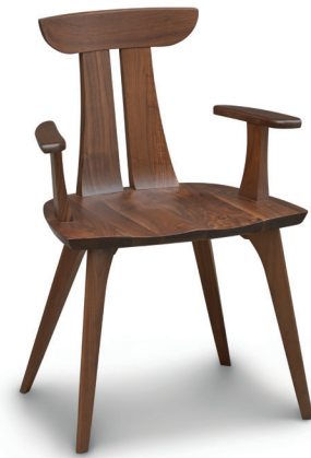
Estelle Arm Chair 8-EST-52-04