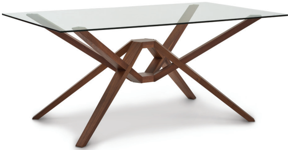
42" x 72" Glass Top Table

Exeter tables are available in a range of glass top sizes highlighting the unique geometry of the table base.