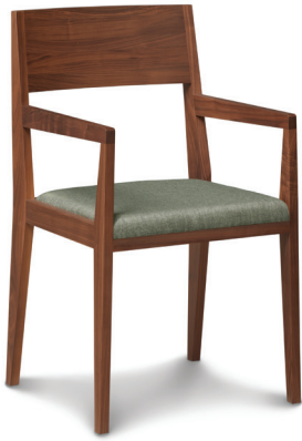
Kyoto Armchair 8-KYO-42-04