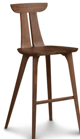
Estelle Bar Stool - seat height 30" 8-EST-65-04