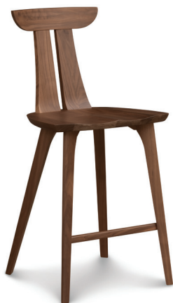
Estelle Counter Stool - seat height 26" 8-EST-60-04