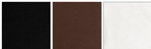
EBONY LEATHER (3312)