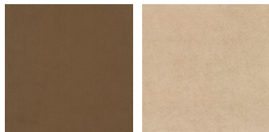
DARK BROWN MICROSUEDE (89104)